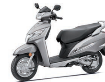
Strontium Silver Metallic #