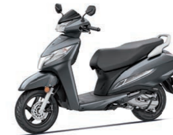
Heavy Grey Metallic