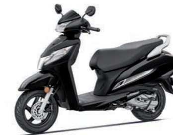
Pearl Night Star Black