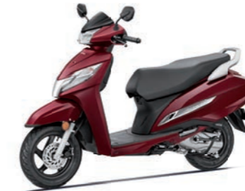
Rebel Red Metallic