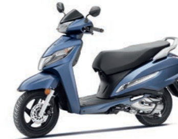
Midnight Blue Metallic